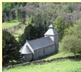
St. Melangell's Church, Pennant Melangell, Powys