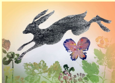
Original artwork © 2018 Mesha Heading Commissioned by Lantern