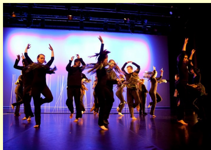
"ENIGMA" for UDance 2013

Our Clear Space project was commissioned by the Isle of Ely Arts Festival & funded by Arts Council England.