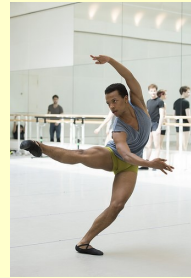
Lantern's Patron, Solomon Golding of the Royal Ballet.

Date for your diary Friday 28th August "Spiritus" Lantern's 11th annual lunchtime performance in the Lady Chapel of Ely Cathedral. 1:10 p.m. Free admission with Resident's Pass.