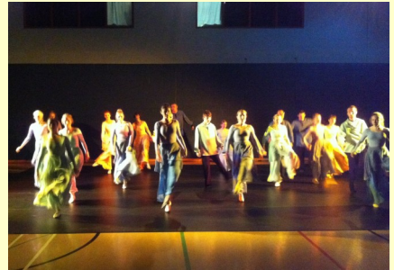
Lantern at the Paradise Centre, June 2014

Our Tall Tales project was commissioned by the Isle of Ely Arts Festival & funded by Arts Council England.